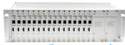
16PCS 1 Port HDMI Encoder in 3U Chassis

Real time Linux® based multichannel HDMI AVC/H.264 audio and video HD live encoder with 4 to 16 HDMI inputs and 4 to 16 IP outputs. Supports input and output resolutions up to 1080p at 60 fps. Streams to Ustream and Atlas™, Wowza®, and Adobe® Flash® Servers. Optional HDMI and CVBS version available.