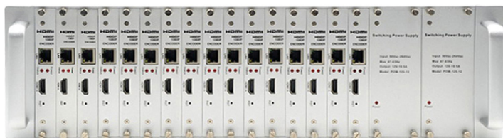
4-16 HDMI Inputs, 4-16 IP Output Ports