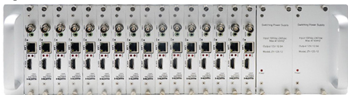
4-16 HDMI Inputs, 4-16 CVBS Inputs, 4-16 IP Output Ports