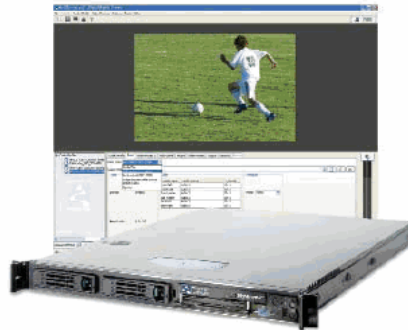
Digital Rapids StreamZHD

Digital Rapids showcased Version 1.1 of its Stream Transcode Manager for high-volume multiformat content workflows. New features include server-level failover, extended integration with third party databases, clip trimming and automated head/tail clip addition. Also introduced was an AVC