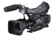
JVC GY-HD 100U