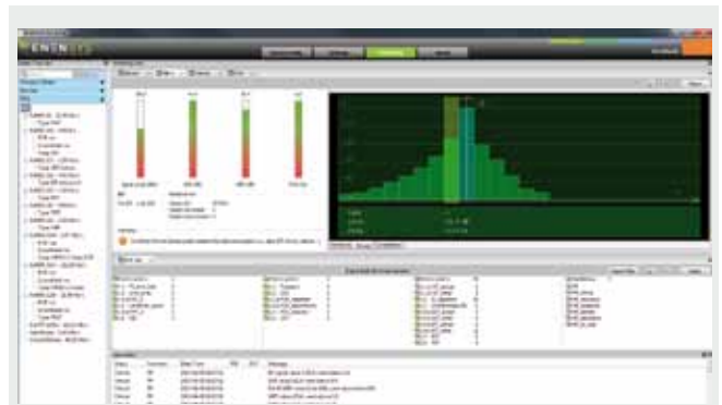
Monitoring view : RF, ETR, Logs